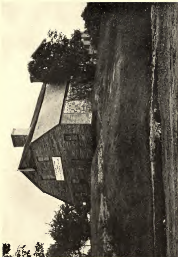
THE OLD JAIL AT YORK, BUILT 1653